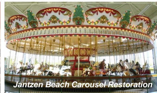
Jantzen Beach Carousel Restoration