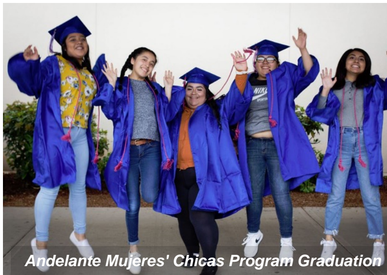
Andelante Mujeres' Chicas Program Graduation