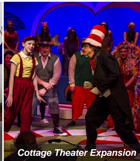
Cottage Theater Expansion