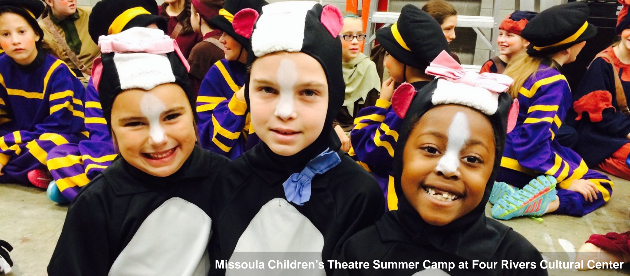
Missoula Children's Theatre Summer Camp at Four Rivers Cultural Center