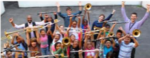
BRAVO Youth Orchestras, funded in part by the Oregon Cultural Trust.