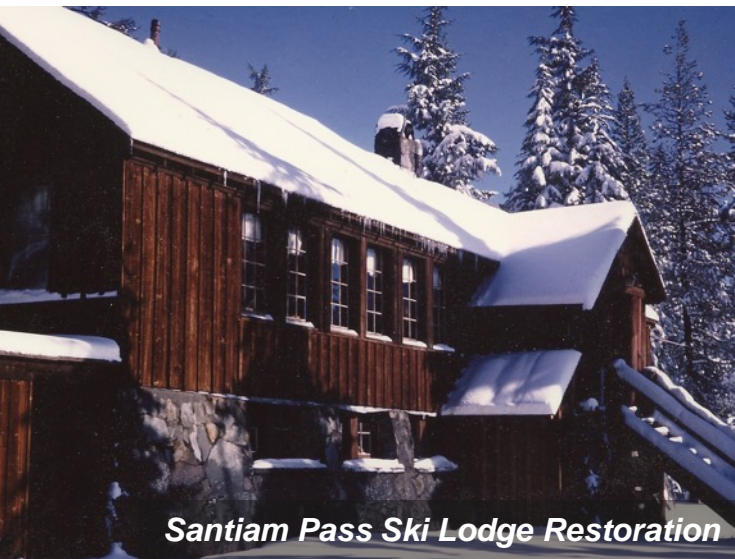
Santiam Pass Ski Lodge Restoration

This is your secret weapon to use on behalf of culture.