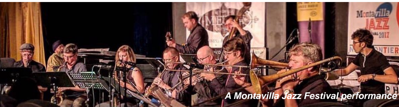
A Montavilla Jazz Festival performance

Funding comes solely from Oregonians who “earmark” a greater portion of their state tax funds for culture using the Cultural Tax Credit.