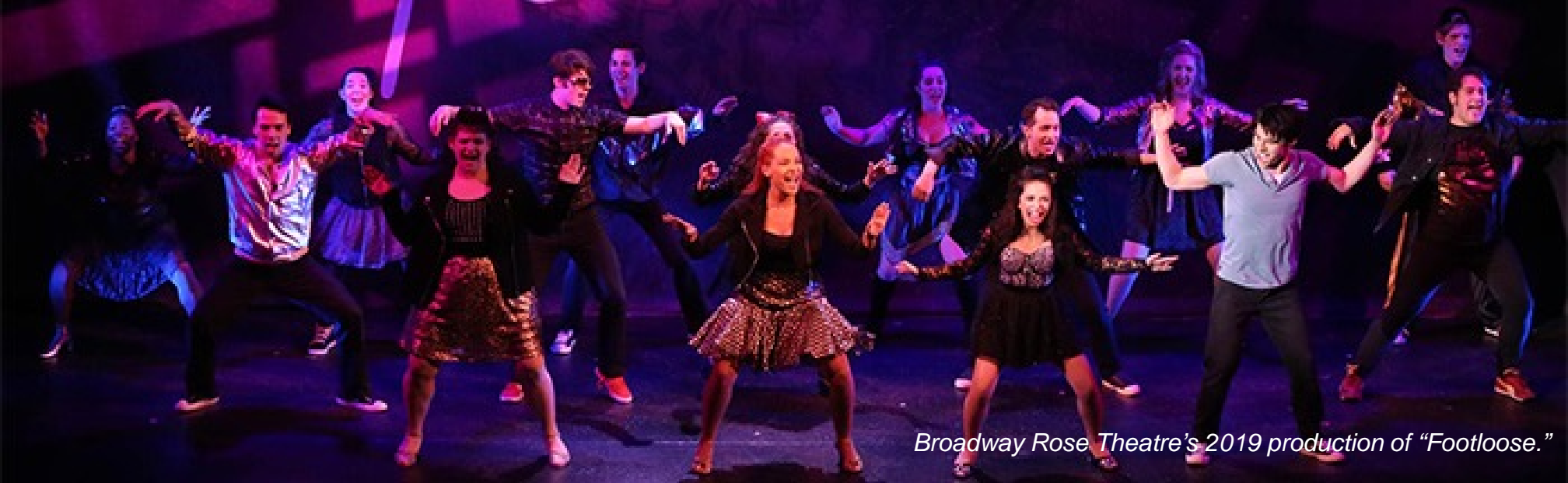
Broadway Rose Theatre's 2019 production of "Footloose."